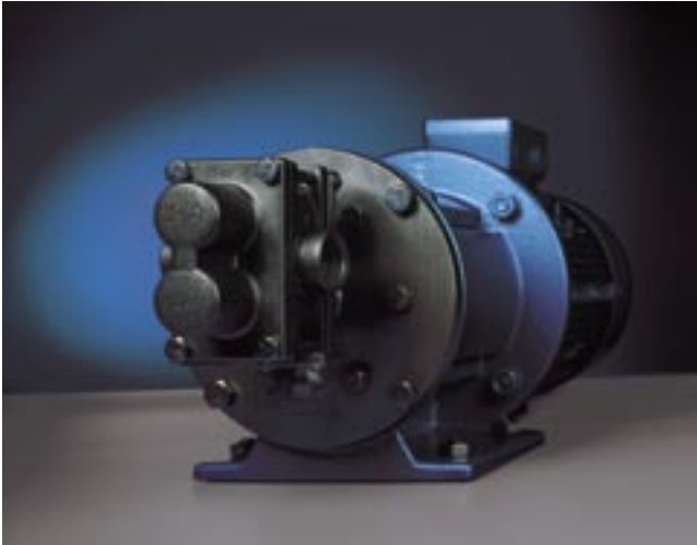
The Liquiflo series of gear pumps consists of 10 models for a large capacity range.